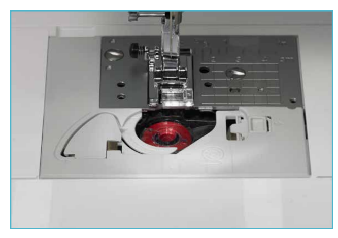
Quick-Set, Drop-in Bobbin With a drop-in bobbin, getting ready to sew is easy. When you need a new bobbin, simply drop it in and go. The Aria will put the thread right where you need it.

Comfortably guilt with the Aria's large throat space. 11.25" to the right of the needle leaves room for thick projects and bigger quilts.