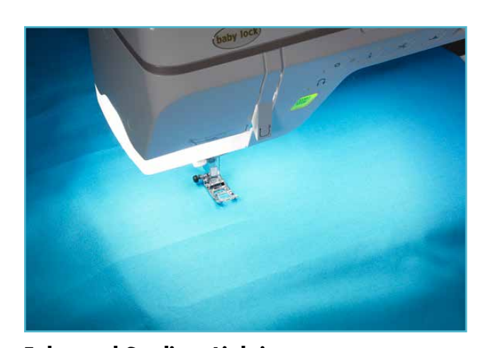
Enhanced Stadium Lighting Illuminate your fabric with 10 inches around the needle. You'll see every detail of your project. Plus, the bright LED lights last longer so you won't worry about changing light bulbs.

Fabric always feeds evenly when you use the Digital Dual-Feed System. Whether stitching on difficult fabric or multiple layers, the Digital Dual-Feed System will keep your fabric feeding consistently.