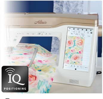
IQ Positioning App

Use the IQ Intuition Positioning App to position your design exactly where you want it, how you want it – every time.