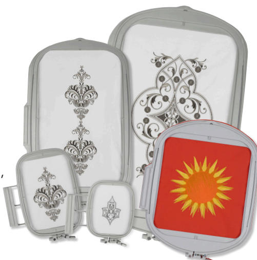
9.5" x 9.5" Hoop

Stop and start sewing with the main pedal while the heel tap and side pedal handle two additional functions. Select from single stitch, position needle up/down, thread cutting, and reverse stitch. The knee lift allows for hands-free sewing.