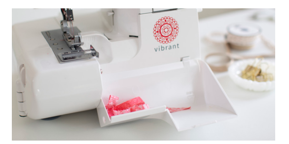
Trim Bin - What mess? Attach this handy bin to the front of the Vibrant and those loose threads and scraps are caught right up as they fall.

Easy Color-Coded Threading - New to serging? Don't be afraid! Following Vibrant's color-coded thread system, you'll have your serger threaded in no time at all!