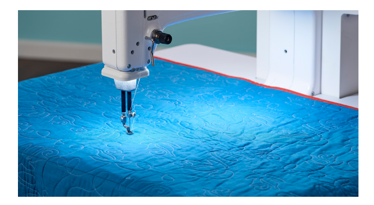
Enhanced Workspace Lighting Long lasting, high-intensity LED lights illuminate your needle area and workspace so you can see every detail on your quilt.

Access your hardware and software options, lighting options, stitch counters and more through the intuitive LCD touch screen.