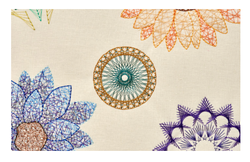
Long Stitch Embroidery Patterns Stitch unique, decorative designs with long, overlapping stitches.