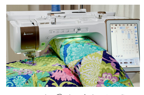
13" to the Right of the Needle With an unprecedented 13" to the right of the needle for an impressive 65 square inches of workspace, Solaris Vision gives you plenty of room to comfortably work on larger projects and full-size quilts.