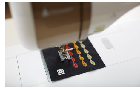
End Point Setting for Sewing Achieve perfect stitches using the built-in camera and end point sewing stickers. Simply place the sticker where you want your stitch to end, activate the end-point sewing feature and sew with confidence!