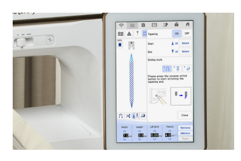
Stitch Tapering Match your project's sharp angles or create mitered corners with Solaris Vision's Stitch Tapering function. With 12 angle settings, three ending methods, and 20 decorative stitches, you can customize a variety of sewing projects.