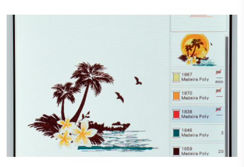
Deselect Region (No Sew Setting) Deselect regions of a design to preview and stitch the design with fewer colors.