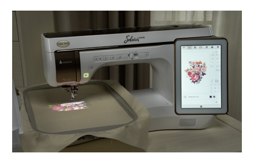
IQ Visionary™ Projector- Precise Embroidery Placement While in embroidery mode, choose from three different projection backgrounds (black, grey or white) based on fabric choices to see your design clearly. The needle drop laser is displayed in a point or a "T" pattern for an even more precise placement.