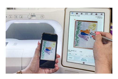
IQ™ Designer and IQ Intuition™ Positioning Create your own designs and quilt motifs with ease. Draw directly on the screen, scan in your favorite artwork, upload an existing file using a USB drive, or wirelessly send artwork to your machine from your smart phone using the IQ Intuition Positioning App. Your art will be instantly converted for embroidery!