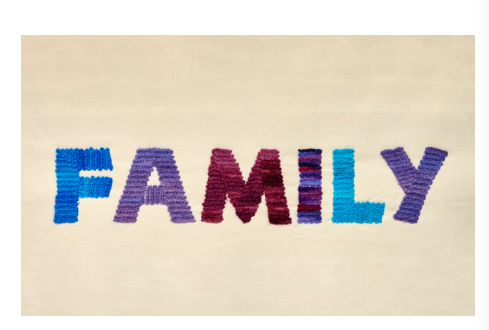
Fill Couching Alphabet Stitch dimensional couched letters, characters and designs.