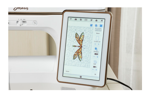
Quilting Around an Embroidery Pattern Add stippling, echo quilting, or any of the 48 Decorative Fill patterns from IQ Designer around a selected design. Line spacing, distance and frame size are all easily adjustable.