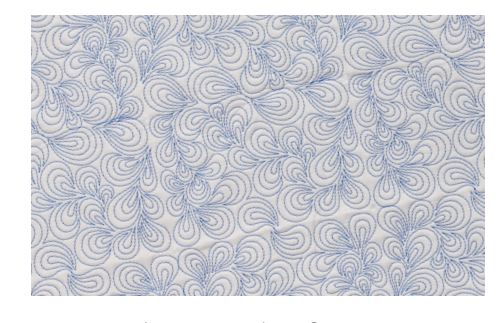
Edge-to-Edge Quilting Create beautiful edge-to-edge quilting projects using the 10 built-in patterns. Enter a few measurements, select a hoop, specify flip options, and the Solaris Vision sets up your entire quilt. The on-screen instructions and design projections guide you every step of the way for quilts measuring up to 118" x 118".