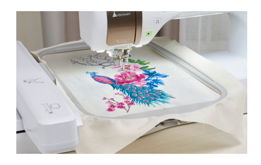
Hoop Sizes The 10-5/8" x 16" (272mm x 408mm) hoop is Baby Lock's largest hoop yet. It makes it possible to stitch out your biggest embroidery designs with fewer rehoopings. The 10-5/8" x 10-5/8" (272mm x 272mm) hoop size is perfect for quilt blocks.