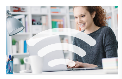
Wi-Fi Enabled Wi-Fi enabled for optional download of update files, apps, and design transfer with Design Database Transfer or Palette 11 (optional purchase).