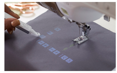
TQ Visionary— Perfect Sewing Placement The Solaris Vision uses a variety of guideline markers and grids for perfect placement. While in sewing mode, switch between three different laser colors (red, green and white) for better visibility based on fabric choices.