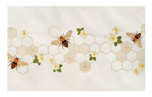
Large-connect Embroidery Patterns Embroider large, stunning patterns in three connecting segments using the camera to precisely align each segment.