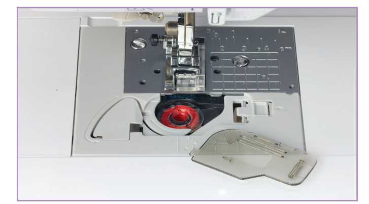
Quick-Set, Top-Loading Bobbin When you're ready to sew, simply drop a bobbin in and go. It's always easy to get started.

The Quick-Set Bobbin Winder makes it easy to prep multiple bobbins ahead of time. Simply load your bobbin and thread, and the Lyric will wind the bobbin until it's full.