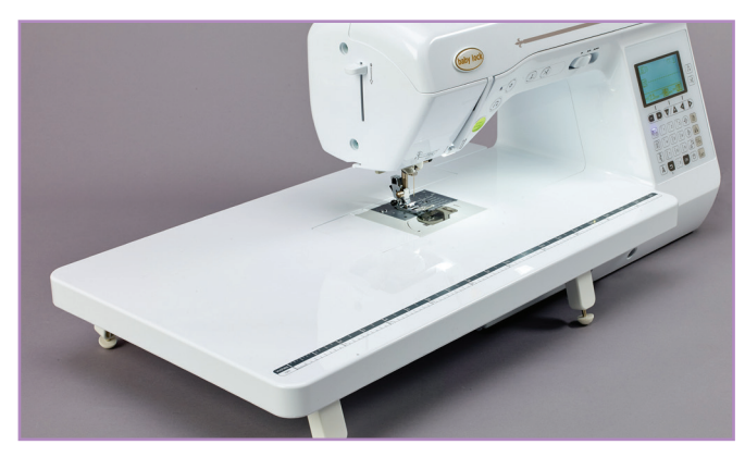
Quilting Extension Table Increase your sewing surface and provide extra support for larger projects.